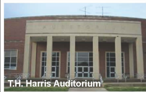
T.H. Harris Auditorium