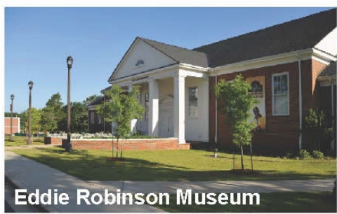
Eddie Robinson Museum