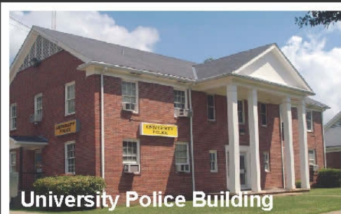
University Police Building