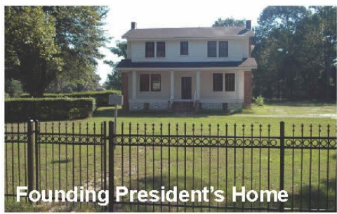
Founding President's Home