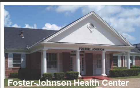
Foster-Johnson Health Center